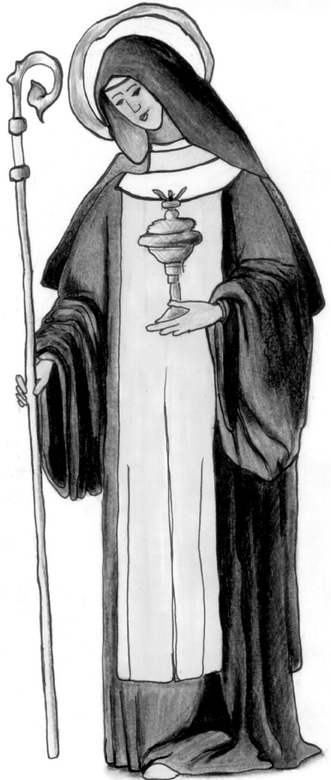
ST. GERTRUDE OUR PATRONESS