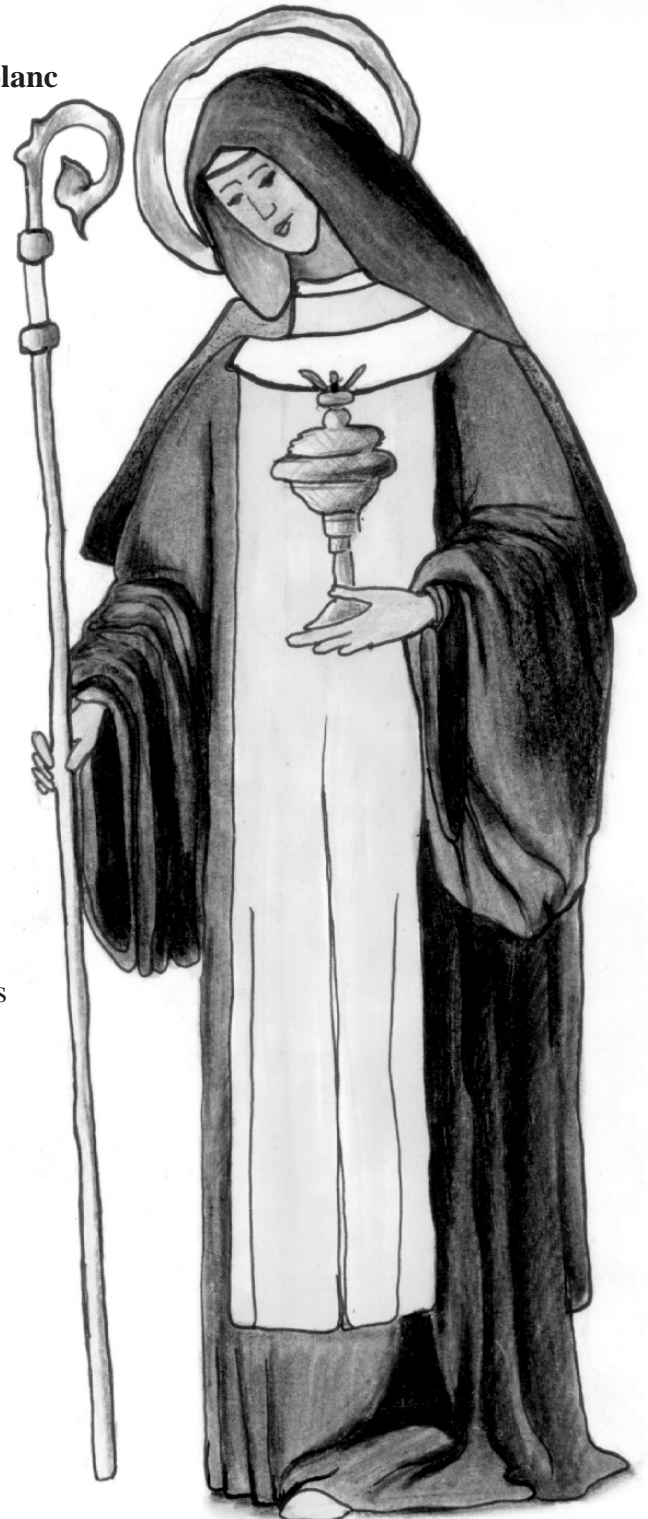
ST. GERTRUDE OUR PATRONESS

Durham Catholic District School Board 905-576-6150, www.dcdsb.ca