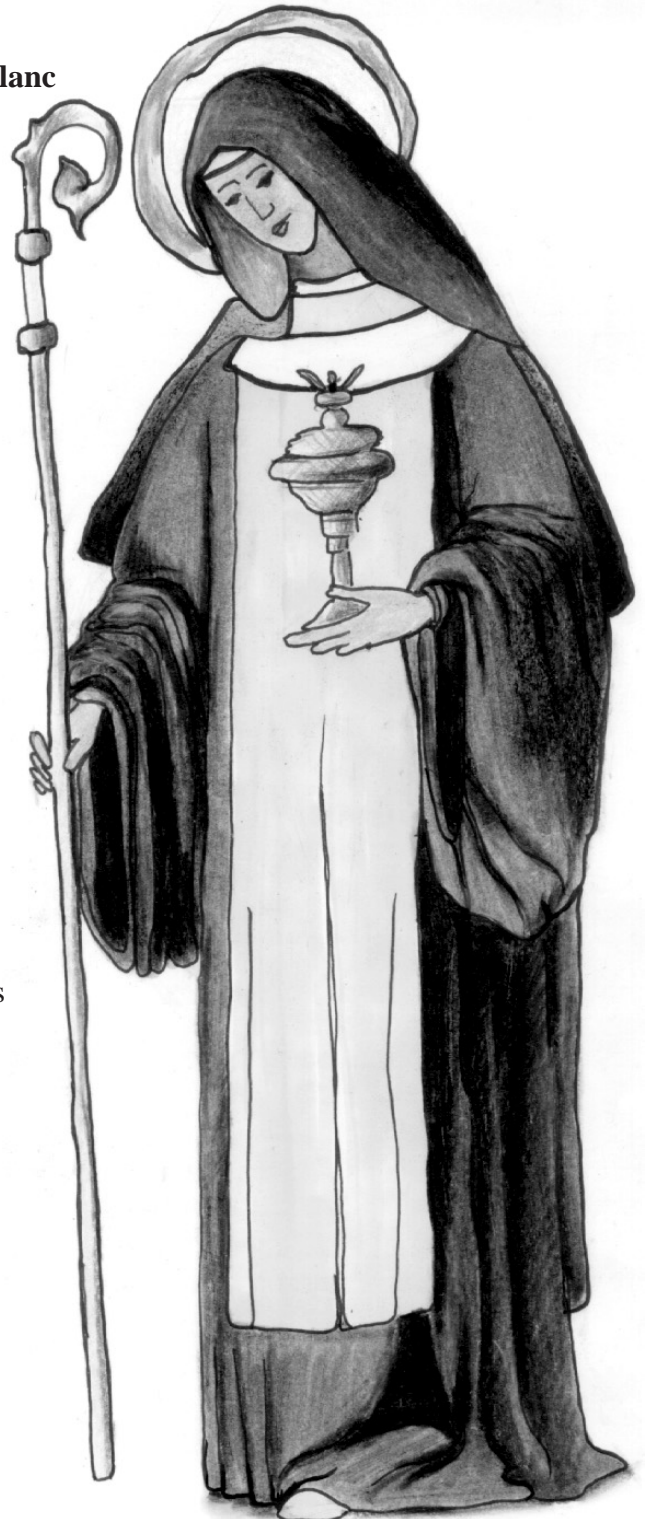
ST. GERTRUDE OUR PATRONESS

Durham Catholic District School Board 905-576-6150, www.dcdsb.ca