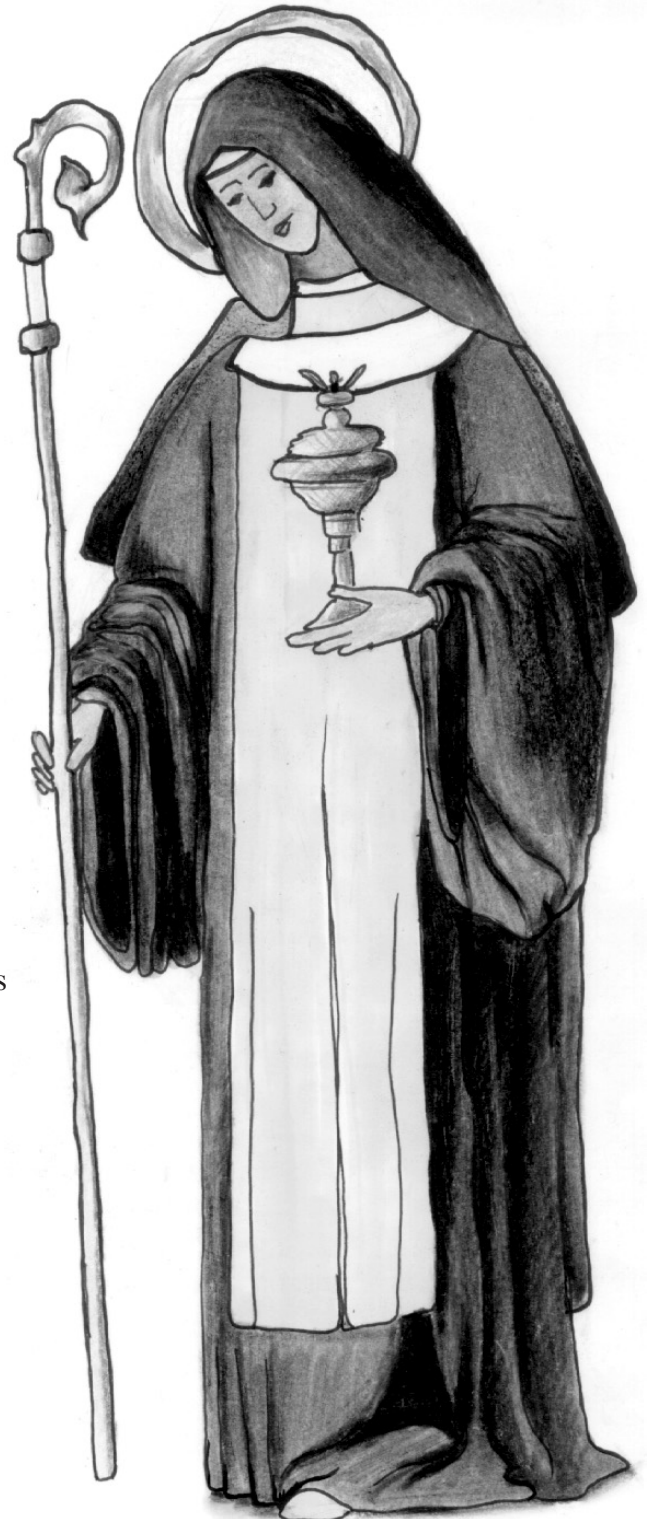
ST. GERTRUDE OUR PATRONESS

Durham Catholic District School Board 905-576-6150, www.dcdsb.ca