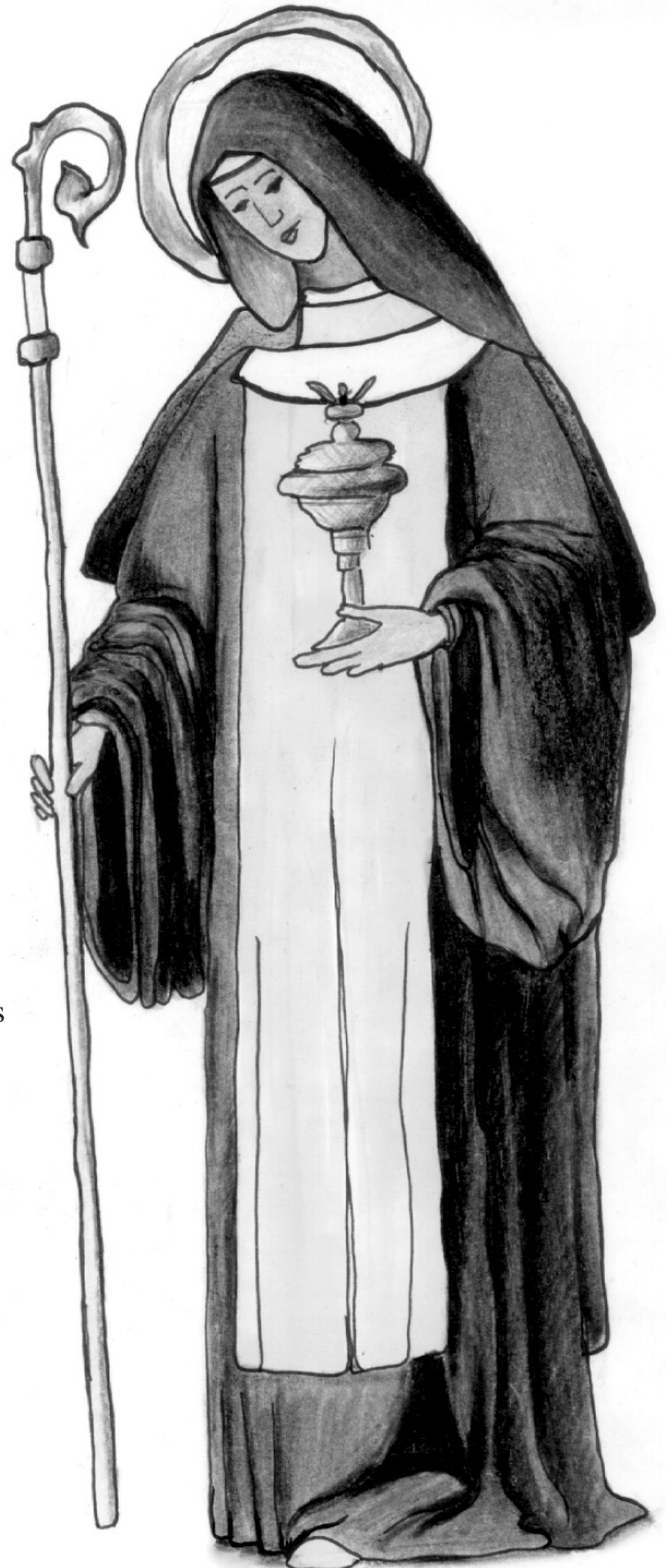
ST. GERTRUDE OUR PATRONESS

Durham Catholic District School Board 905-576-6150, www.dcdsb.ca