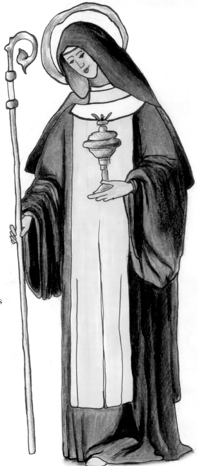
ST. GERTRUDE OUR PATRONESS

Durham Catholic District School Board 905-576-6150, www.dcdsb.ca