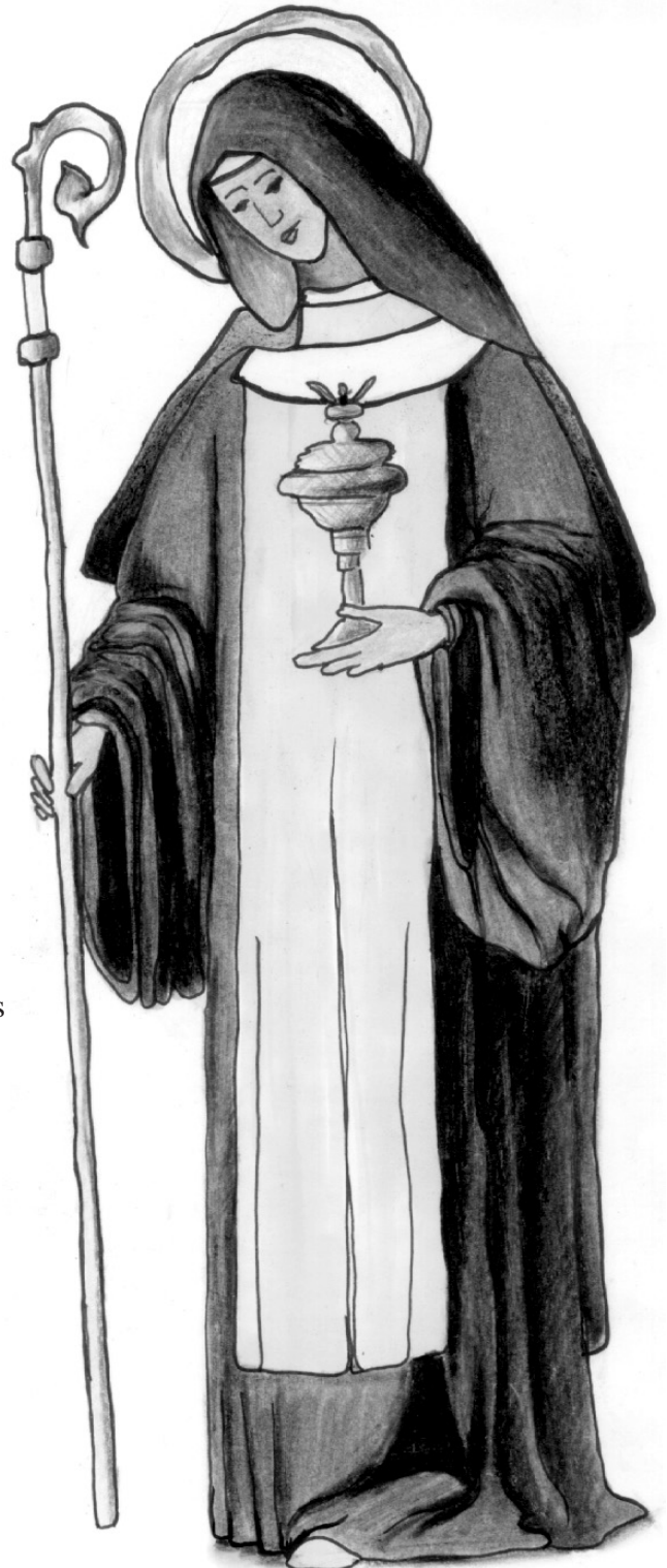
ST. GERTRUDE OUR PATRONESS

Durham Catholic District School Board 905-576-6150, www.dcdsb.ca