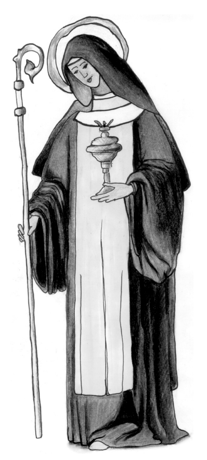
ST. GERTRUDE OUR PATRONESS