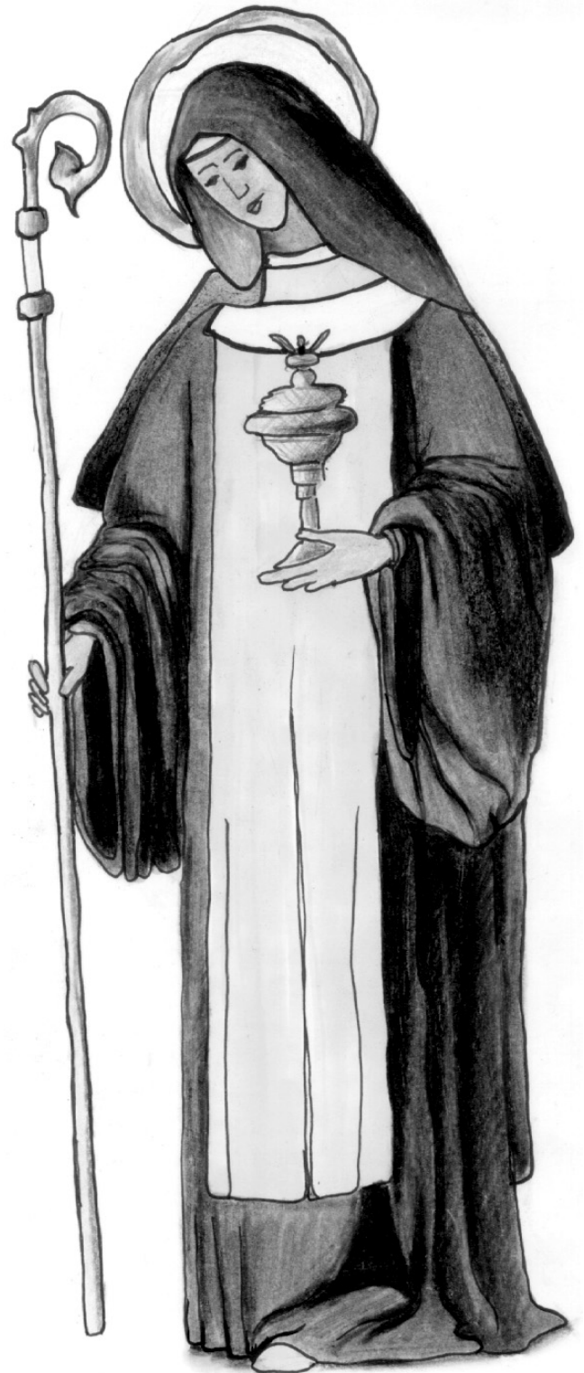
ST. GERTRUDE OUR PATRONESS