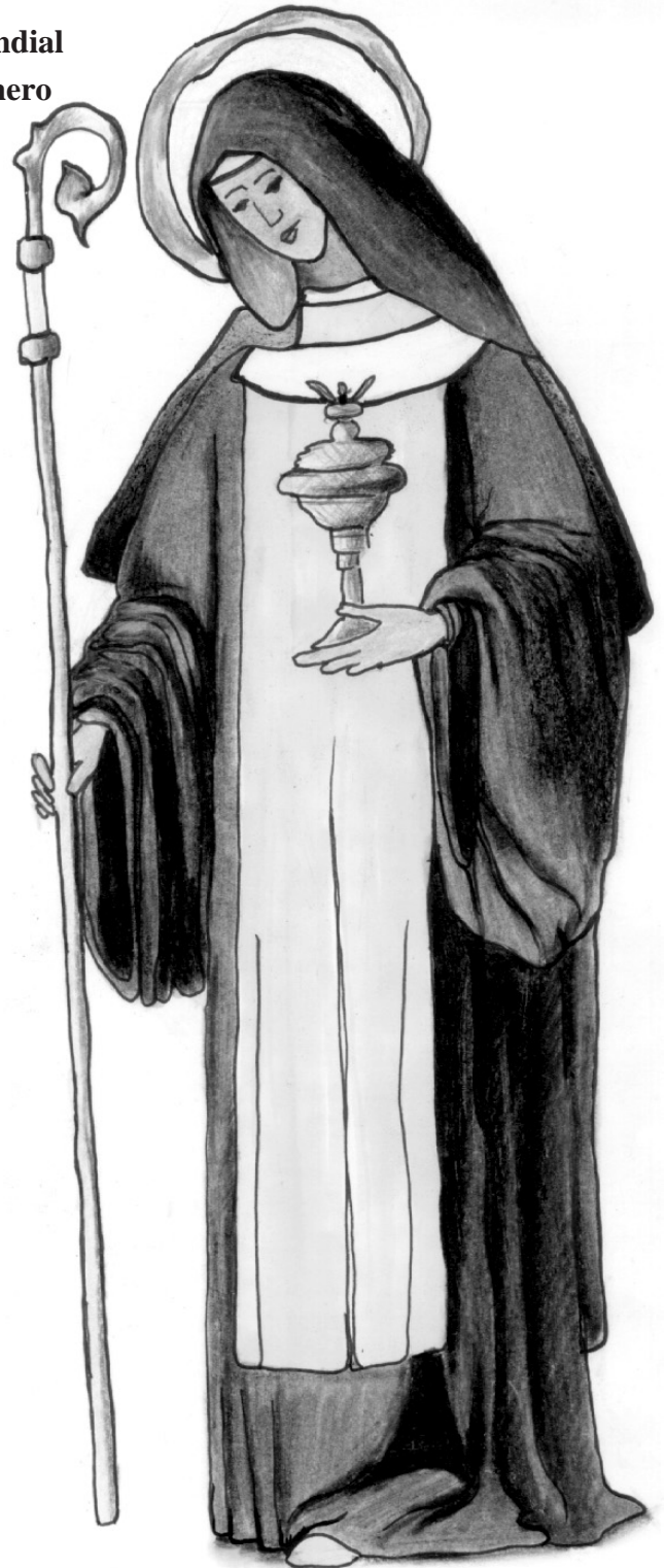
ST. GERTRUDE OUR PATRONESS