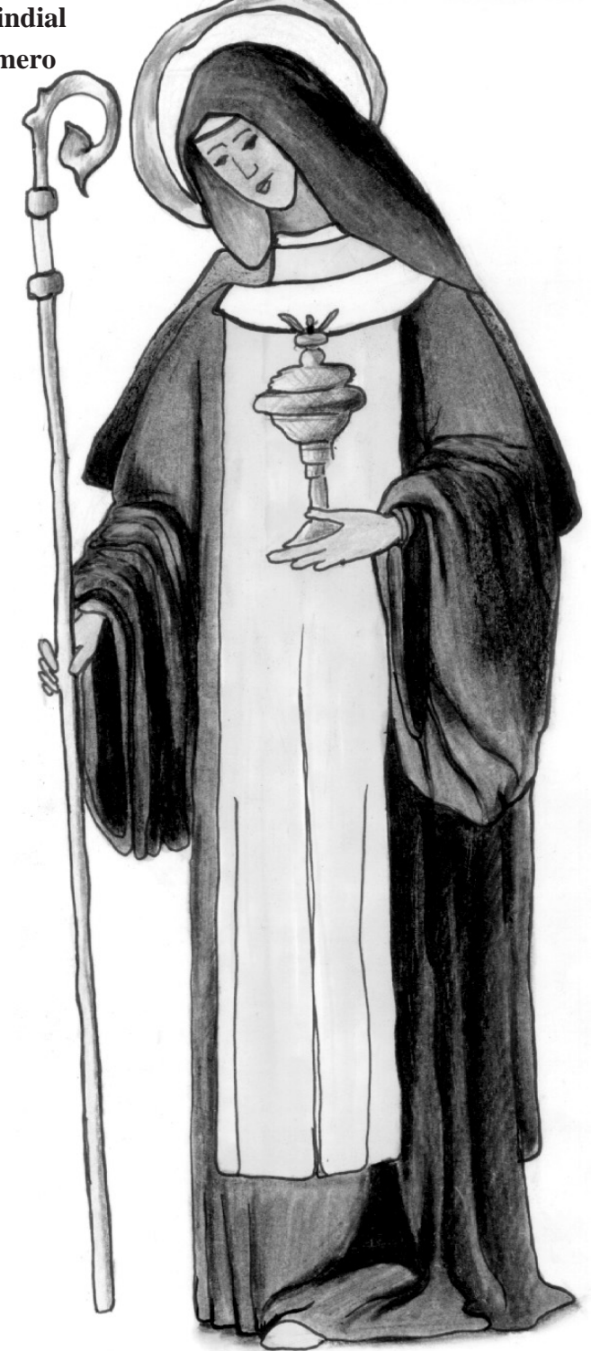
ST. GERTRUDE OUR PATRONESS