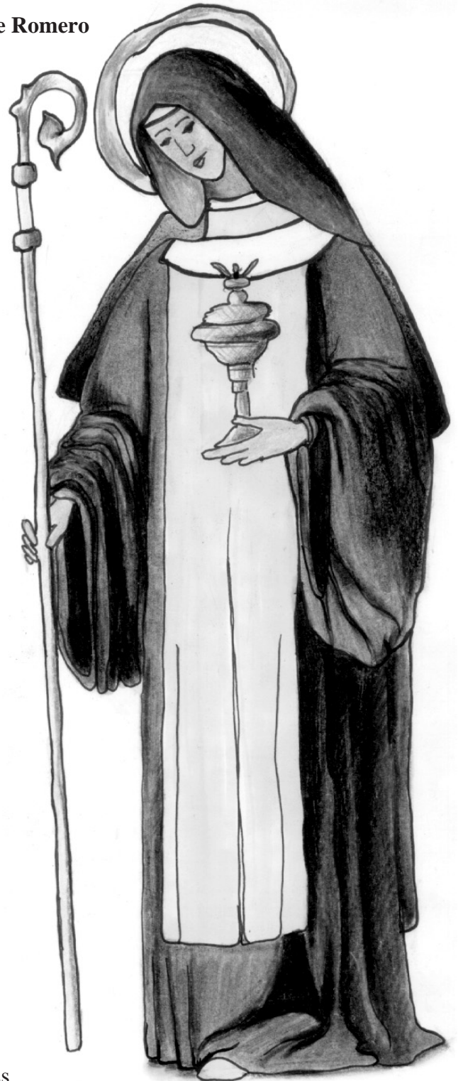
ST. GERTRUDE OUR PATRONESS