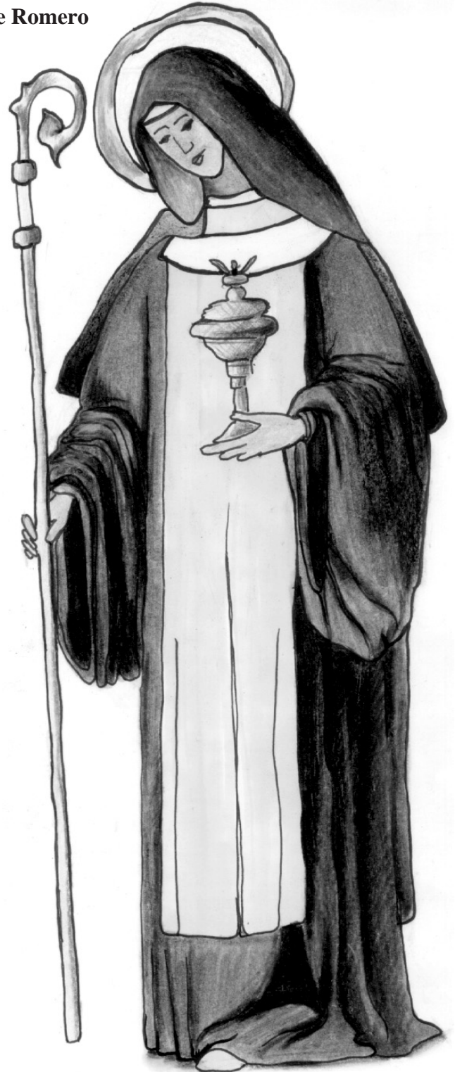
ST. GERTRUDE OUR PATRONESS

Must be registered for at least 12 months and attending Mass each Sunday and supporting the Church and its mission. Volunteering helpful.