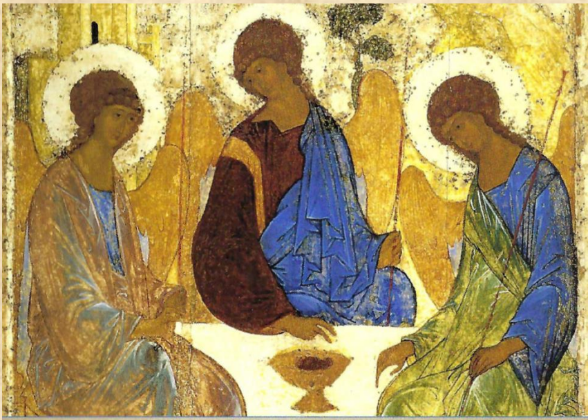
Angels at Mamre (Holy Trinity) by Andrei Rublev, 15 th Century

Beyond images of fire and falling stars, the Book of Revelation develops an elaborate portrait of a Christ with many Faces who stands at the center of life—on earth and in heaven—alongside God the Father Almighty in the power of the Holy Spirit.